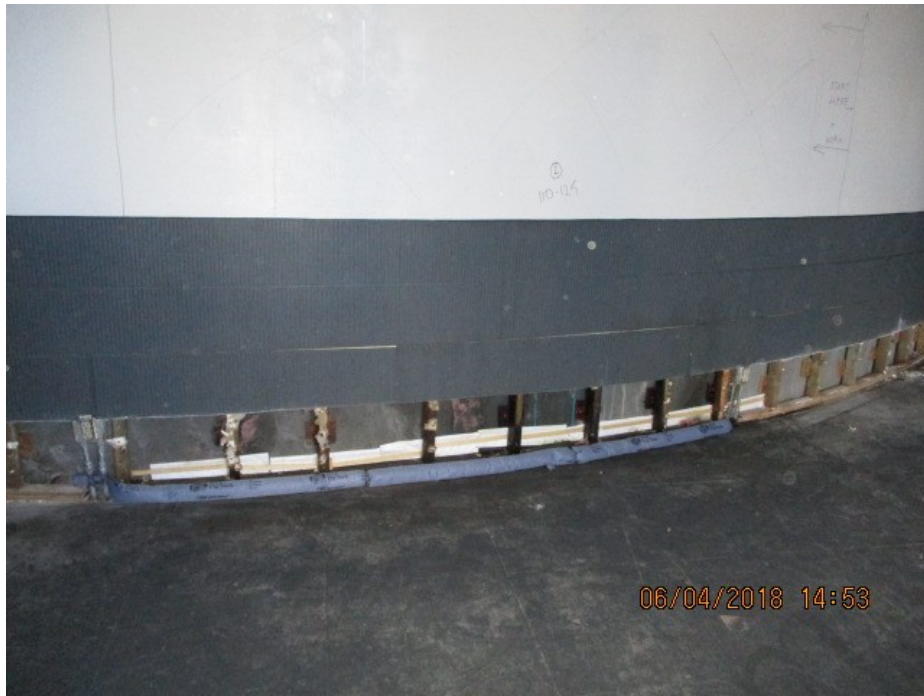
Photograph #3– Absorbent material placed at bottom of pier to capture seepage