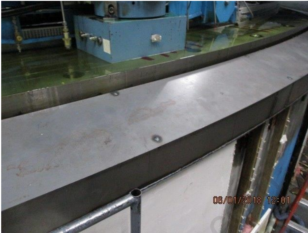
Photograph #1– Hydrostatic Bearing System– source of seepage