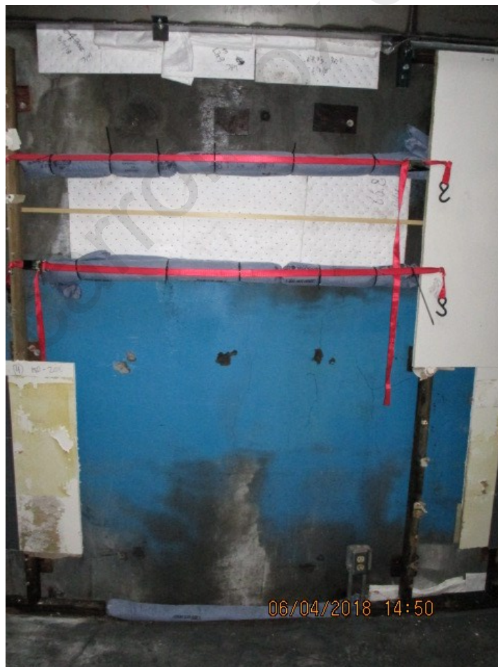
Photographs #4– Absorbent material placed on wall of pier to capture seepage