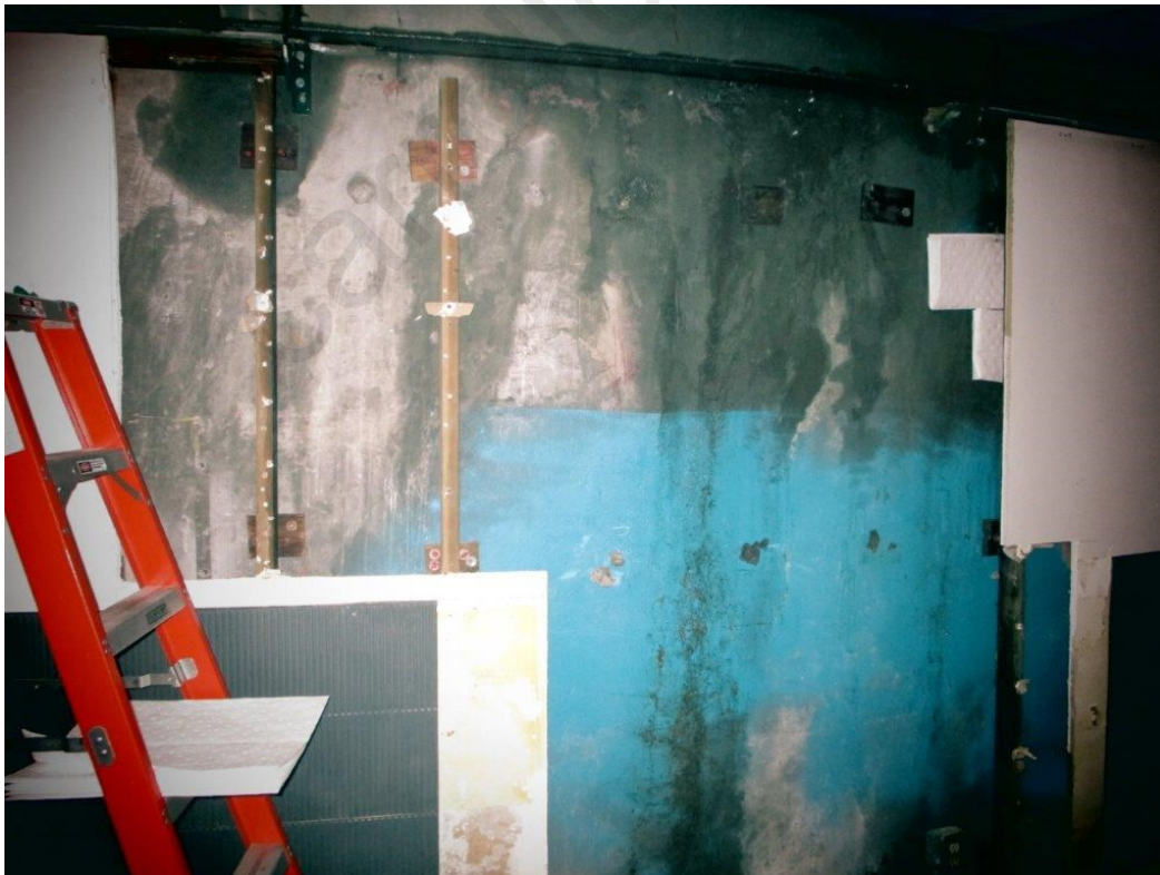
Photograph #2– Evidence of oil on concrete Pier after removing drywall.