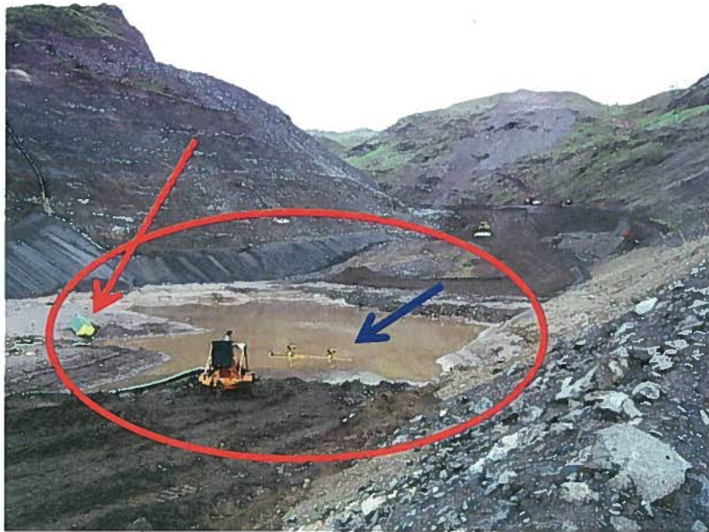
Photograph # 1