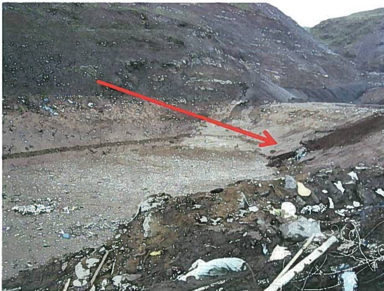
Photograph # 2

Description: North facing view of the E6 cell upstream of the berm. Ponding water (Red Circle), an overturned porta-pottie (Red Arrow) and a submerged piece of equipment (Blue Arrow) was observed in the cell at the time of inspection.